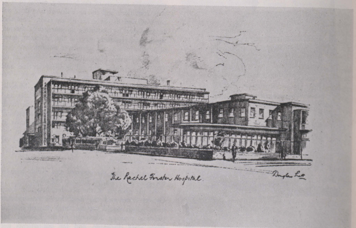
The Rachel Forster Hospital Today