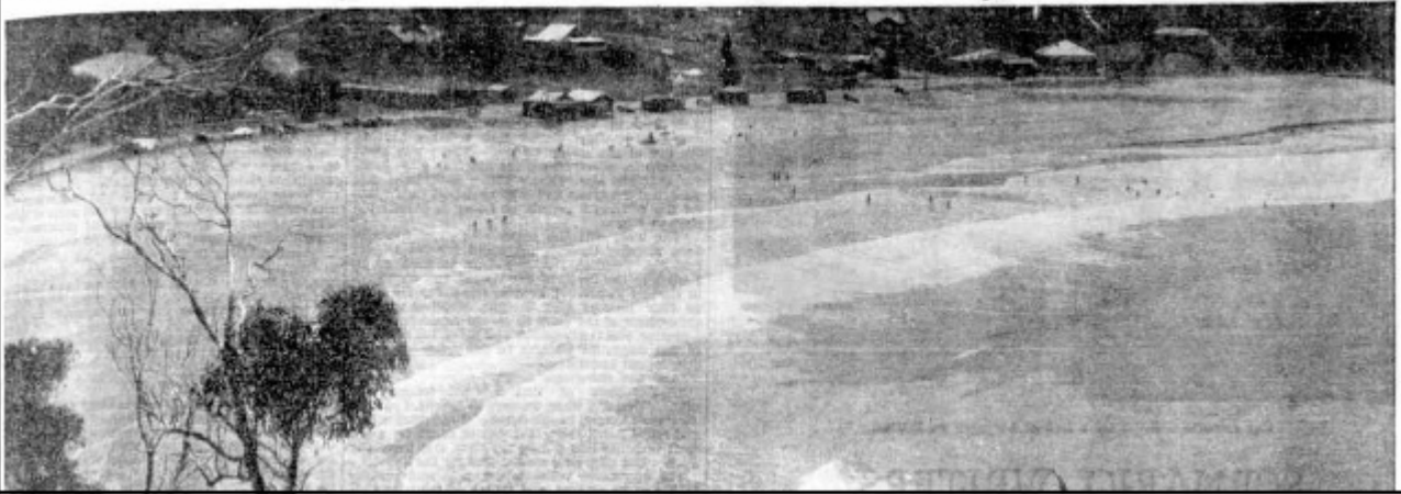
A panoramic view of Palm Beach taken from the headland.