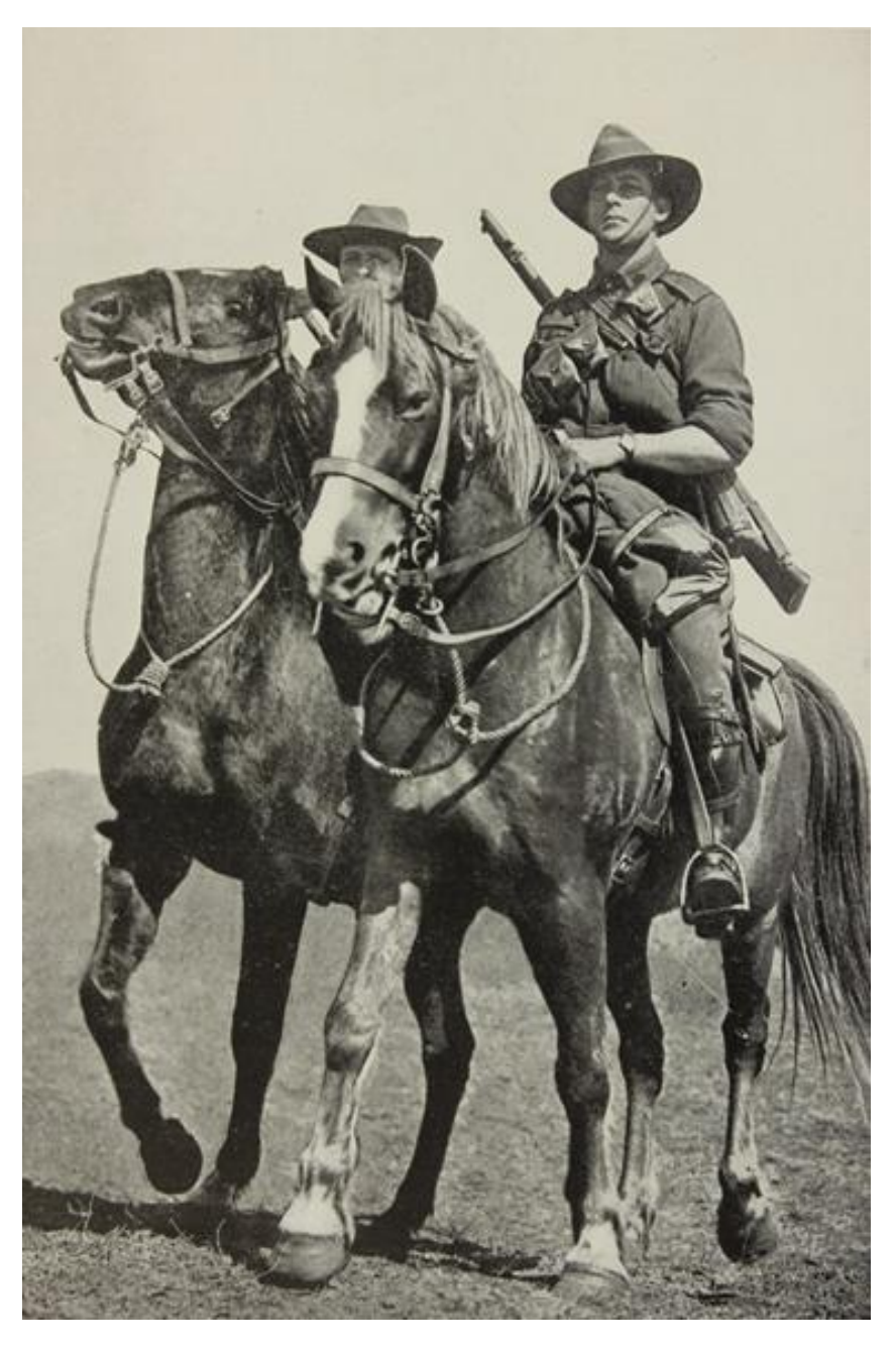
Men of the 1 Light Horse Brigade before departure from Australia, Official History of Australia and the War, Vol. 12, Charles Bean, plate 42

The New South Wales Lancers went under a number of different names before the outbreak of World War One and because some of these names are easily confused with the names of other Regiments I thought it would be good to clarify a little of this history before telling their story.