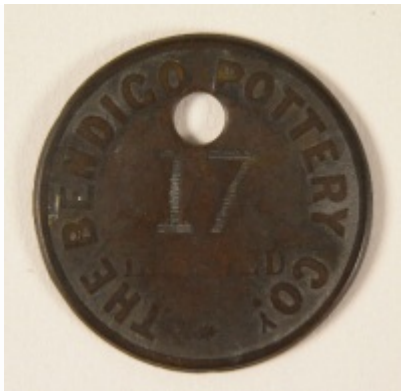
Early 20th century Bendigo Pottery time-keeping token.